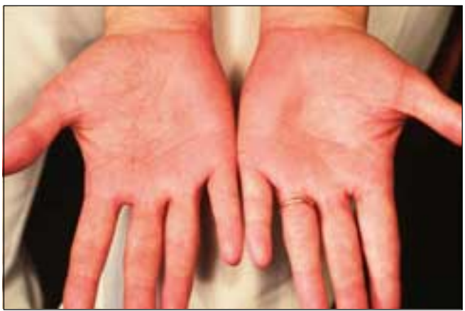
Case 3. Woman age 29

Two years prior to her initial consultation, following severe and persistent emotional stress, she developed pompholyx eczema on the palms of her hands. Although she had almost continual eruptions, the vesicles were always reabsorbed without discharging. 3 months ago, associated with renewed emotional strain, the eczema flared and spread up the arms.